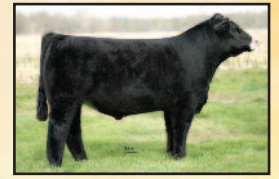
DJ Salution S502