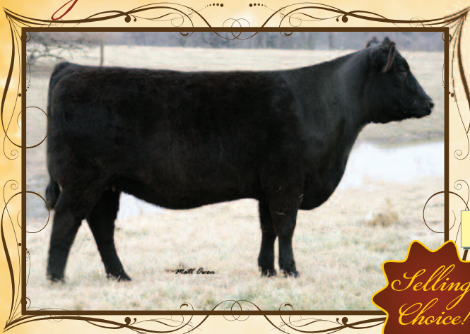
OBCC Daisy May 176R