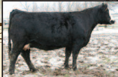
STP Miss P794 Sells as Lot #29