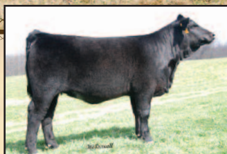
SC Glamours NV R55