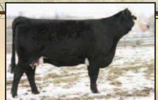
OBCC Foolin You 902P Sells as Lot #2