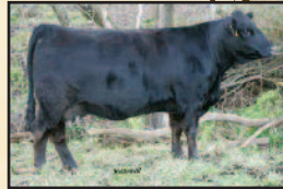
BDV Daphane L1 - Grand Dam of Lot #12

Guest Breeder: Shoal Creek Simmental From our Daphane cow family and a direct daughter of SC Daphane T3, this is a cow family that has worked for us year after year. On her topside is the power of Hustler that packed performance and calving easy all in one pedigree. Style, performance and a nice disposition would best explain this prospect female. Her dam sells as Lot 41.