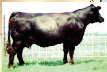
Nichols Beauty D93