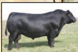
S A V Net Worth 4200