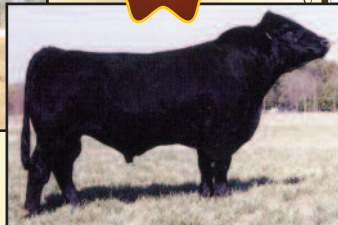
SAC Mr MT 73G