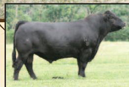
Westfall Voyager 721P