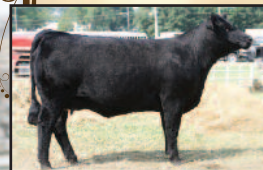
OBC Fools Pride