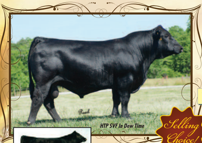
HTP SVF In Dew Time