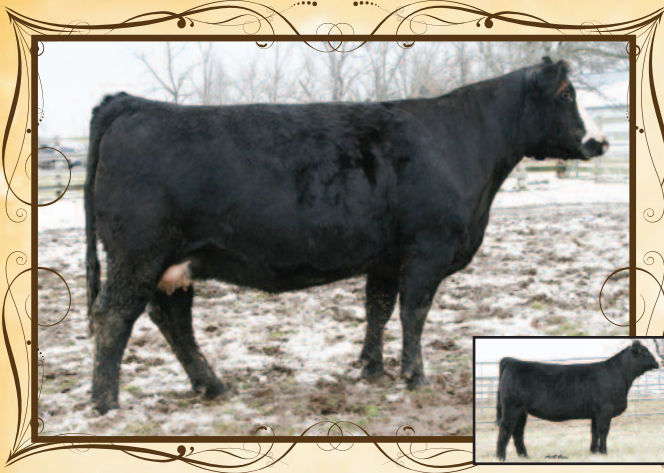
OBCC Temptress P74W