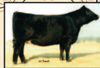
Drake Summer Sister