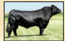
CNS Dream On L186

Guest Breeder: Shoal Creek Simmental True Dream is a solid Dream On daughter out of a blaze faced Nitro cow. She is a level hipped, well balanced female with a bright future.