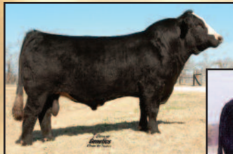
SVF/NJC Built Right N48

Est. EPDs: 8 1.4 31 50 6 4 20 * Carcass: -6.3 -.06 .13 .01 .16 96 58