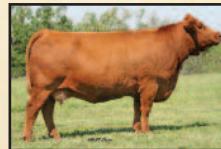
HHSF Shalena - Sells as Lot #6

21b OBCC Daisy May M35W BLACK WHITE STAR DBL. POLLED 3/4 SM 1/4 AN FEMALE ASA#Pending Tattoo: M35W BD: 9-3-09 Adj. BW: 86 ET SIM ANGUS