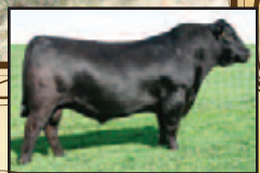
S A V Bismarck 5682