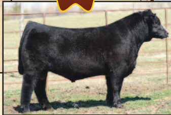
LBS The Foreman 702T