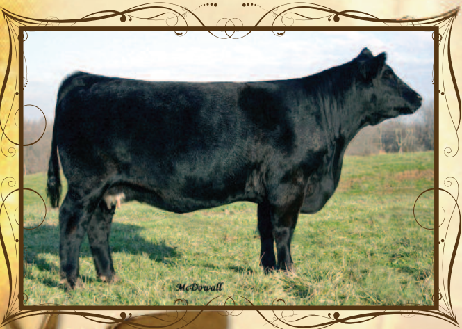
SFI Miss Valentine M78F - Grand Dam of Lot #23

OBCC Perfect Summer M10W BLACK DBL. POLLED PUREBRED FEMALE ASA#Pending Tattoo: M10W BD: 9-13-09 Adj. BW: 89 ET