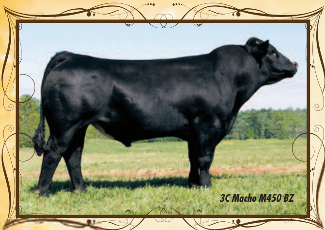
3C Macho M450 BZ