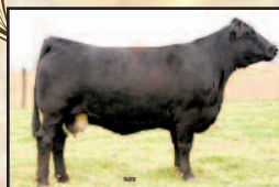
SAFN Glamour 11J - Grand Dam of Lot #11

Guest Breeder: Shoal Creek Simmental Straight from our Glamour cow family and a direct daughter of SC Glamour's NV. NV's Attitude is an eye appealing, deep flanked, high volume female with a super front end. She is definitely the type and kind that we at Shoal Creek are selecting for. W33 is the product of our first embryo mating of Glamour's NV, what an outstanding job so far. We feel this young female has a big future ahead of her, whether in the show ring, the pasture or the donor pen.