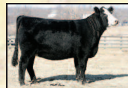
OBC Foolin U P01U