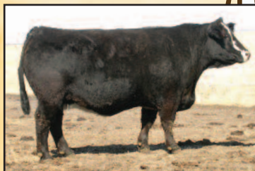
MSR 2094M of J1018 Drive