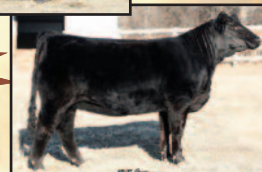
OBC Foolin U Too 902T