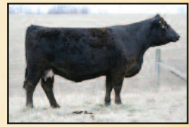
STF Zinfedel PG99 Paternal Grand Dam of Lot #15

BLACK DBL. POLLED PUREBRED FEMALE ASA#2502494 Tattoo: 38TW BD: 4-11-09 Adj. BW: 70 OBCC Macho 001T 3C Macho M450 BZ STF Zinfedel PG99 Midsummer Nights Dream CNS Dream On L186 Drake Summer Sister