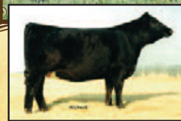
Drake Summer Sister