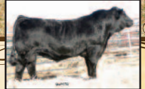
ACC1 Hustler 2N