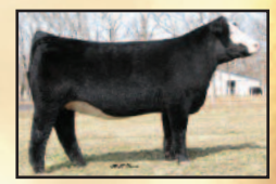
ACC1 Lexus 713R

BLK BALDY DBL. PLD 1/2 SM 1/4 AN 1/8 MX 1/8 CA FEMALE ASA#Pending Tattoo: 713W BD: 4-16-09 Act. BW: 79 ET TFR Naughty Pine Heat Wave TFR L3 ACC1 Lexus 713R SS Goldmine L42 Simons 713G