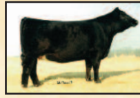
Drake Summer Sister

Performance Data Scrotal: 34 cm Adj. Scan Wt: 1,154 Adj. IMF: 2.57 Adj. REA: 16.33 This is one of three Too Black x 358P (which sells in this offering as Lot 33). This blazed faced bull has near perfect leg design and loads of rear shape and quarter just like the other flush mates. Ranks in the top 15% of the breed for YW and top 25% for WW. Don't miss the opportunity to acquire this performance oriented herd sire!